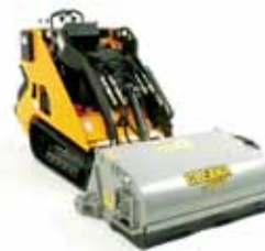
Mini Broom also available